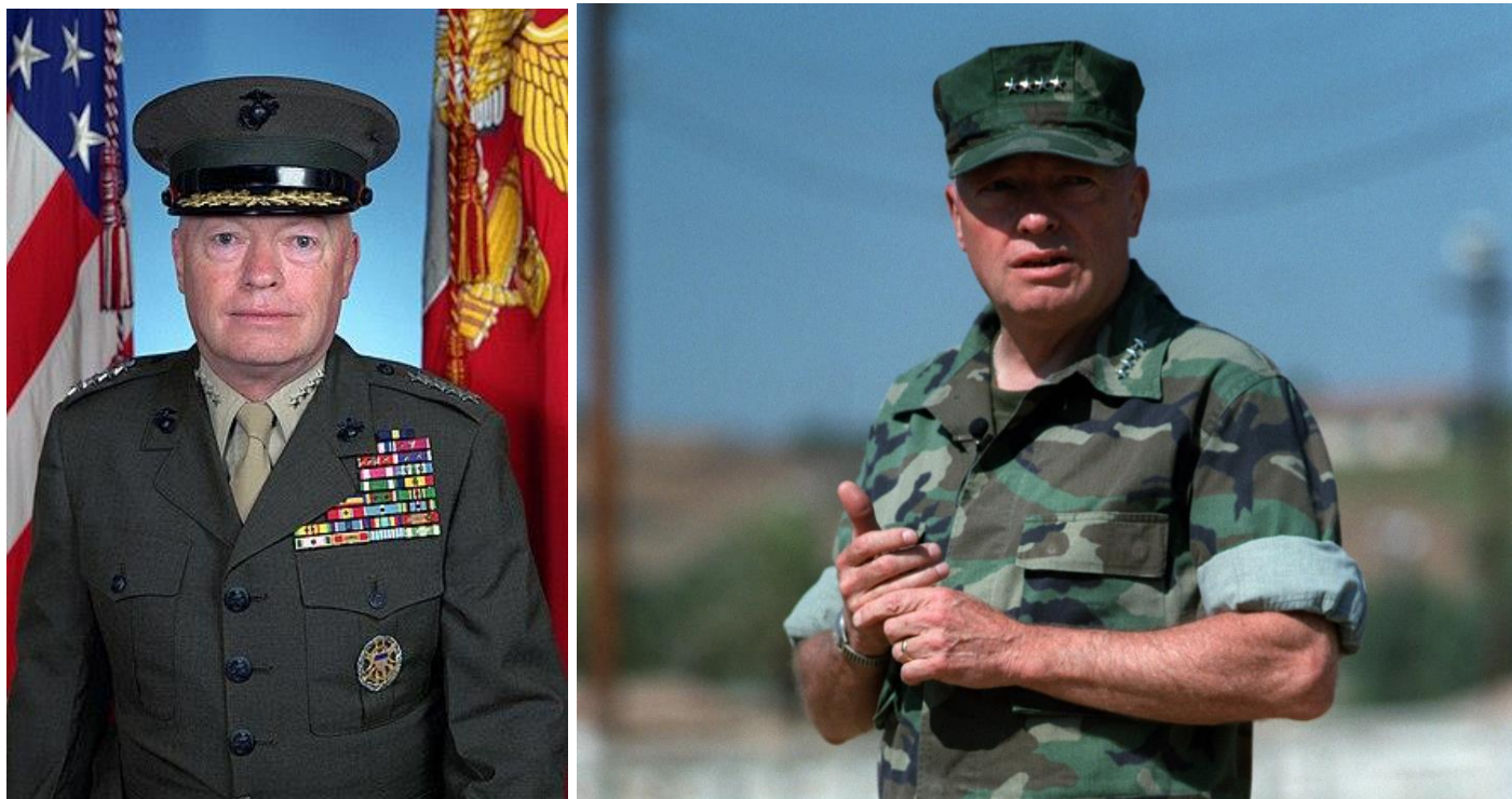
General Alfred M. "Al" Gray

Gen. Al Gray, the 29th commandant of the Marine Corps, died Wednesday in his home following an extended period of hospice care.